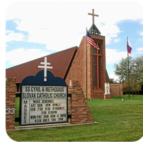
SS. Cyril & Methodius 41233 Ryan Road Sterling Heights