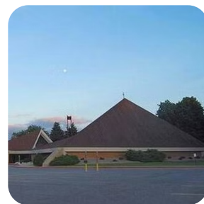
St. Kieran 53600 Mound Road Shelby Township