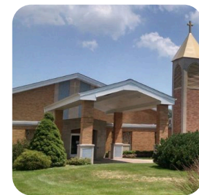
St. Thecla 20740 Nunneley Road Clinton Township