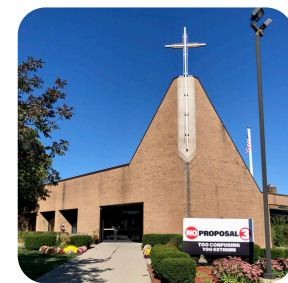
St. Basil the Great 22851 Lexington Ave. Eastpointe