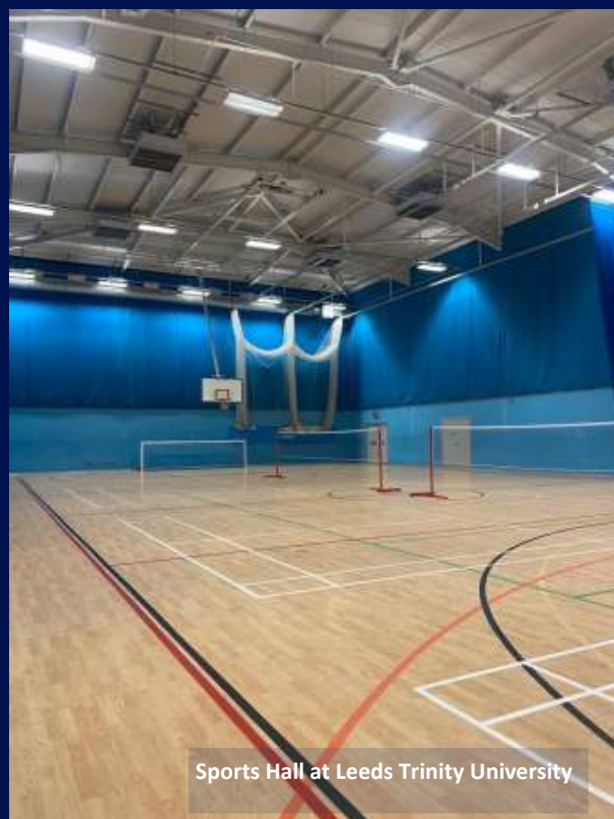
Sports Hall at Leeds Trinity University