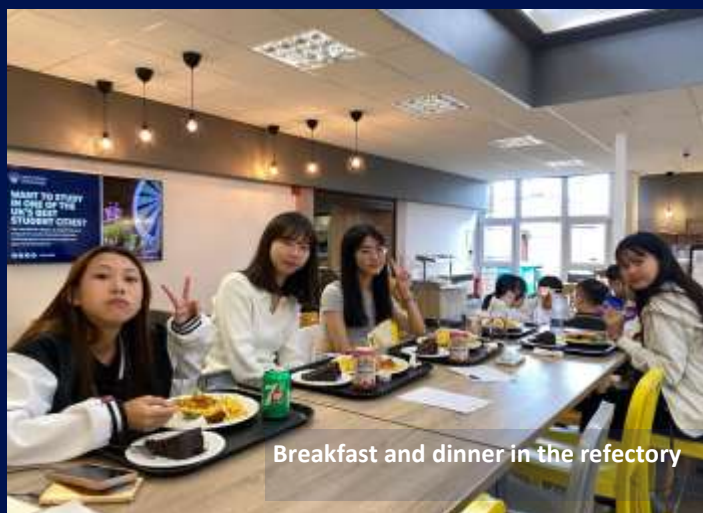
Breakfast and dinner in the refectory