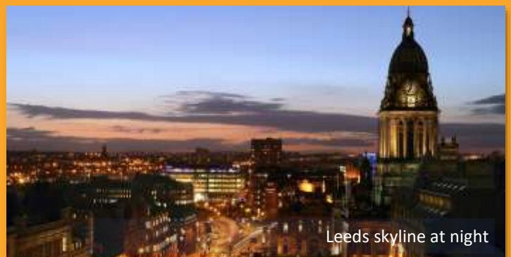
Leeds skyline at night