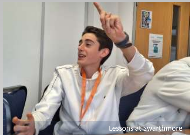
Lessons at Swarthmore