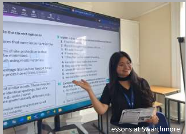
Lessons at Swarthmore