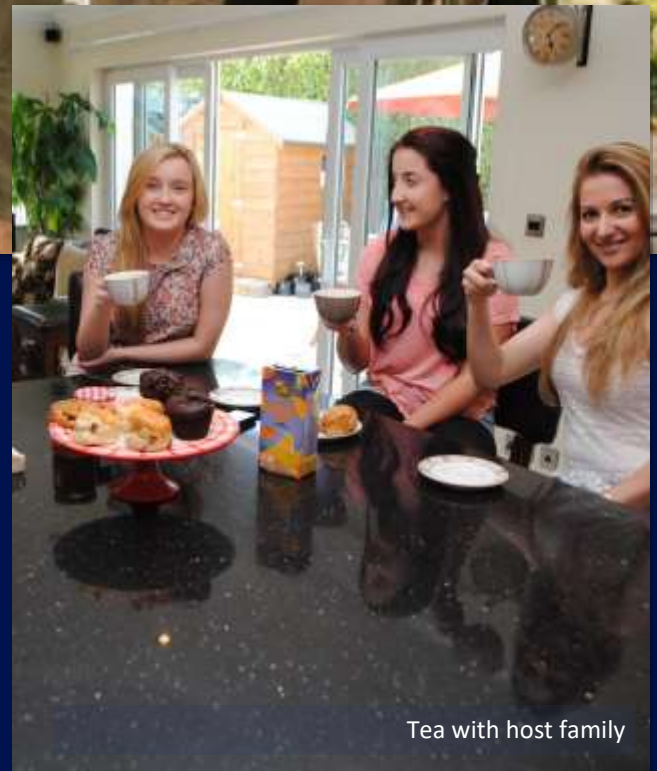
Tea with host family