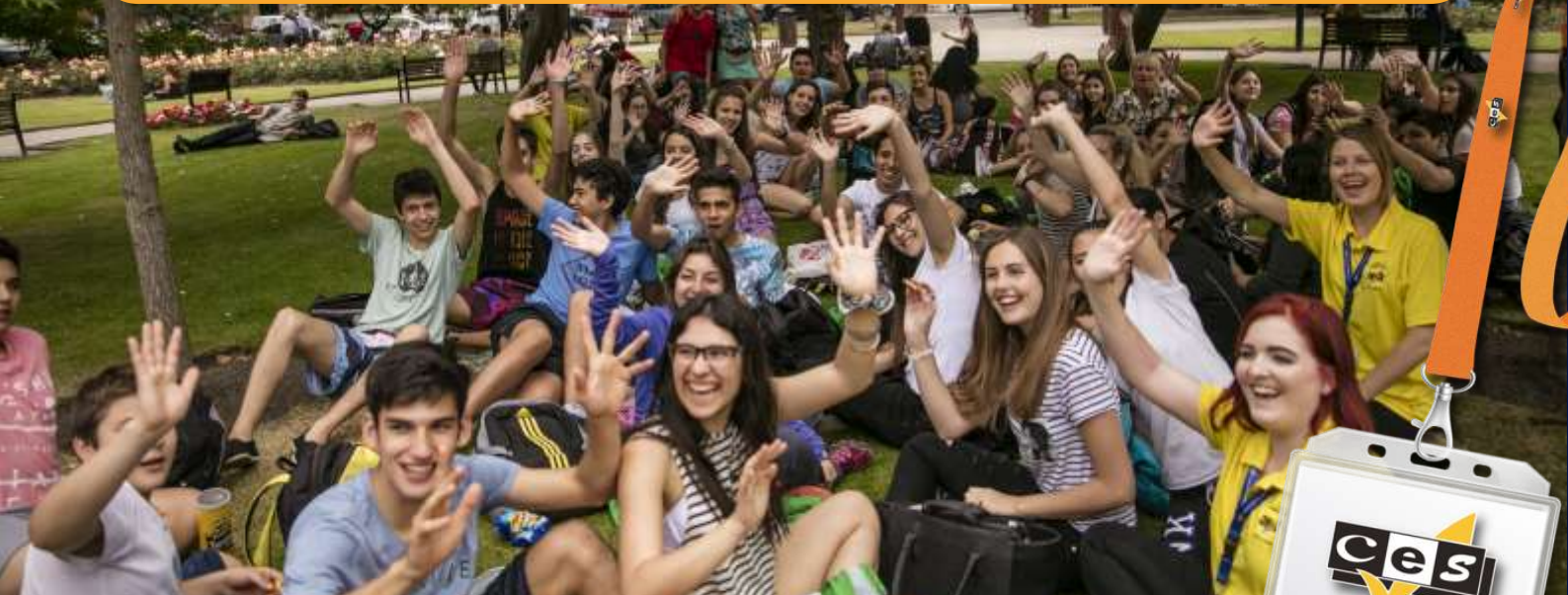
SAMPLE ENGLISH LANGUAGE AND ACTIVITY PROGRAMME