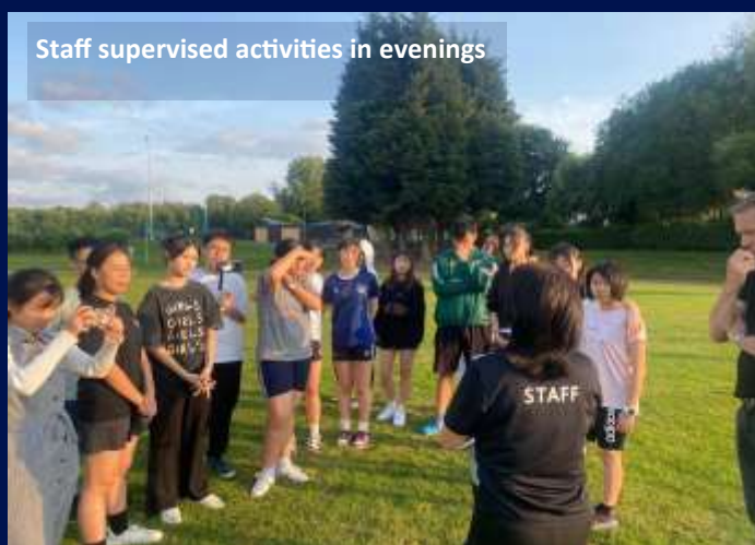
Staff supervised activities in evenings