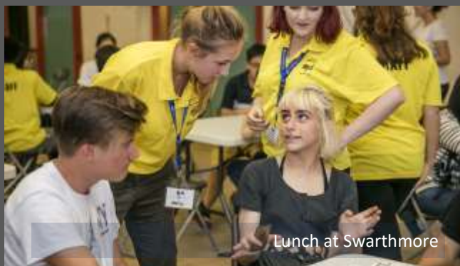
Lunch at Swarthmore