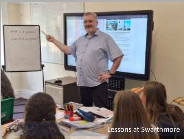
Lessons at Swarthmore