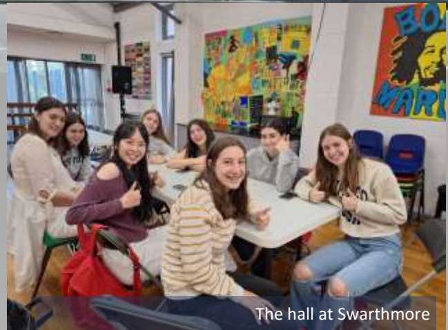
The hall at Swarthmore