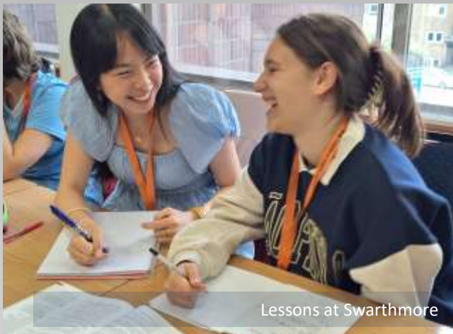
Lessons at Swarthmore