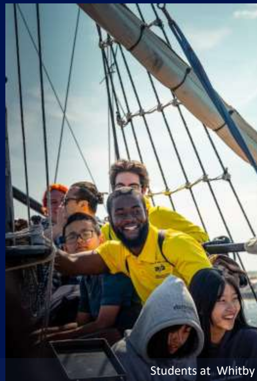
Students at Whitby