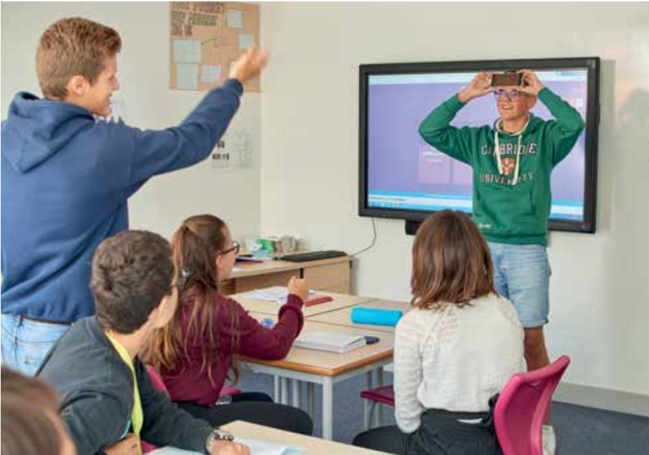
Sample week on the Day Camp or Homestay Programme at LSI Cambridge