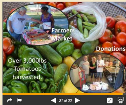
Turner Community Garden from Cheryl Boyer

Turner Community Garden in Wyandotte County