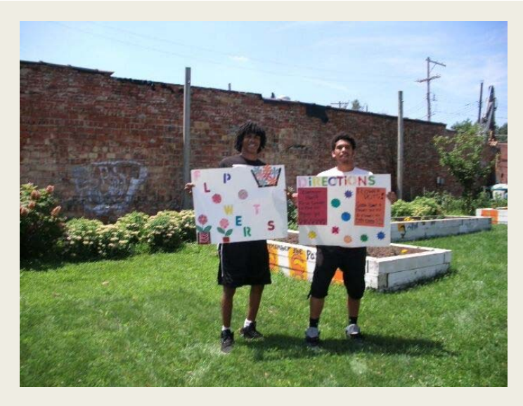
Urban Ag +