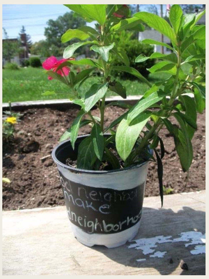
"Good neighbors make great neighborhoods" -Linden community members