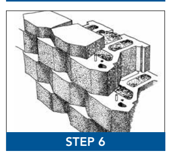
Capping the Wall.

Place the straight fiberglass pins into the holes of each Keystone unit as required. Once placed, the pins create an automatic setback for the additional courses. Place fiberglass connecting pins in the front holes for near vertical (1/8" or [3mm]) setback and in the rear pin holes for 11/8" (29mm) setback per course.