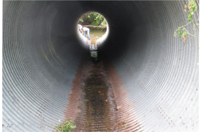
Signs of corrosion on invert.