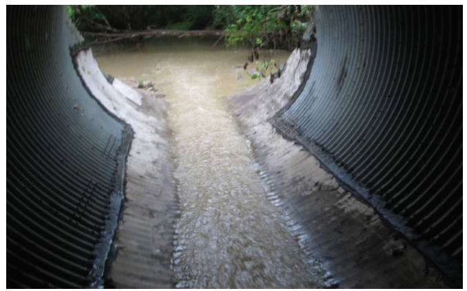
Internal view of completed installation with flow.