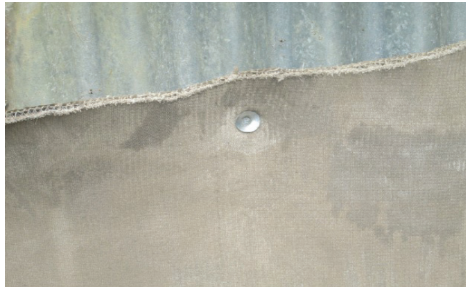
CC8 secured to the culvert spring line with Ramset fasteners.