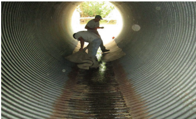
Positioning Concrete Cloth material laterally in invert.