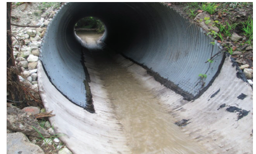
Rehabilitated CMP invert.