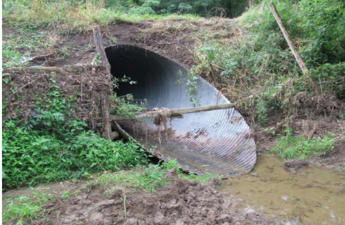
State of culvert before repair.