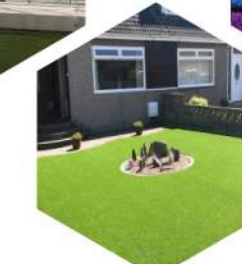
Garden /Frond Yard /Back Yard Terrace /Roof Top /Balconies