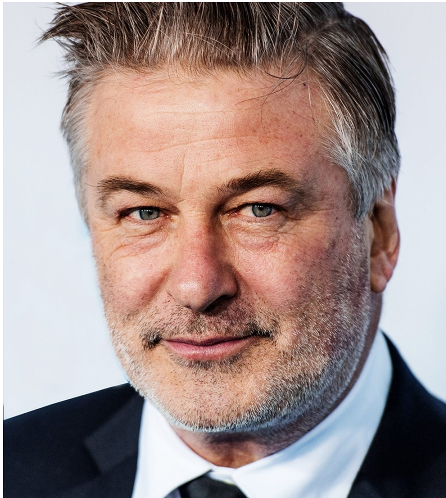
Actor and film producer Alec Baldwin

A cinematographer on the set of a movie set is dead and Alec