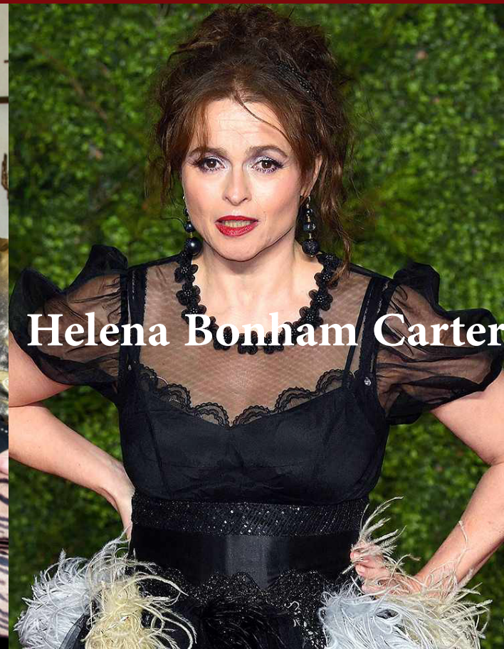
Helena Bonham Carter

Introducing the new faces of Carolina Herrera fragrance