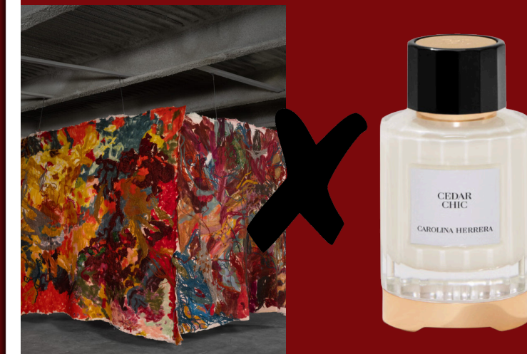
Cedar chic X Sagarika Sundaram Bringing art alive