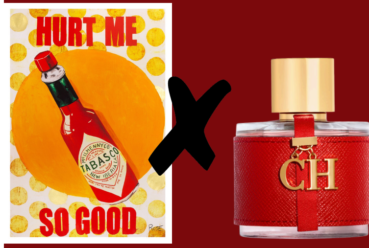
CH WILD X Charlotte Rose Pop culture