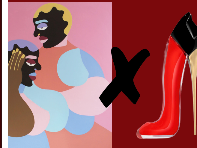
Goodgirl X Deborah Segun redefining art through a feminine gaze