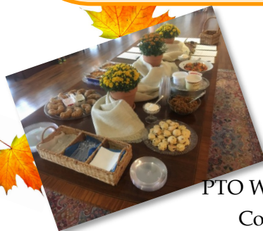
PTO Welcome Coffee