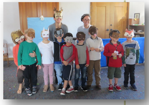
The All Saints 2015-16 Kindergarten Class Performs "The Mitten"

No RSVP needed. Please bring interested friends!