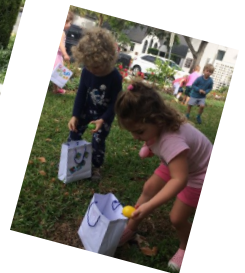
Easter Egg Hunting!