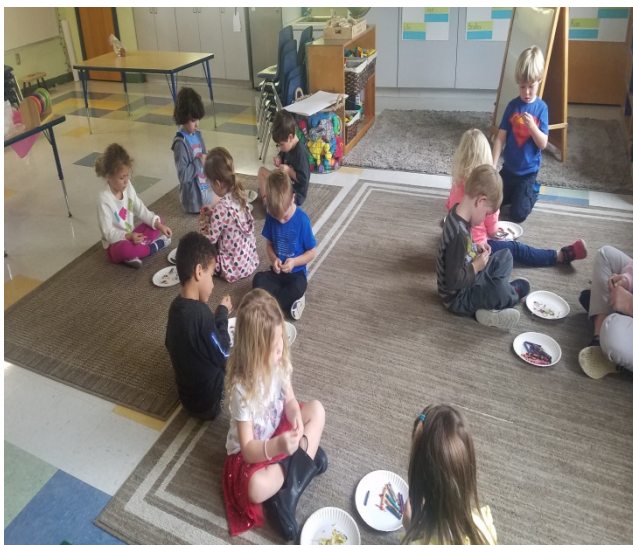
1. Peel and separate.

Our fine motor, social skills and language skills were entertained while peeling crayons and getting them ready for the colorful and creative 'Crayon Cupcakes'. Your children will tell you that it is quite the tedious job and takes a lot of grit, but well worth it.