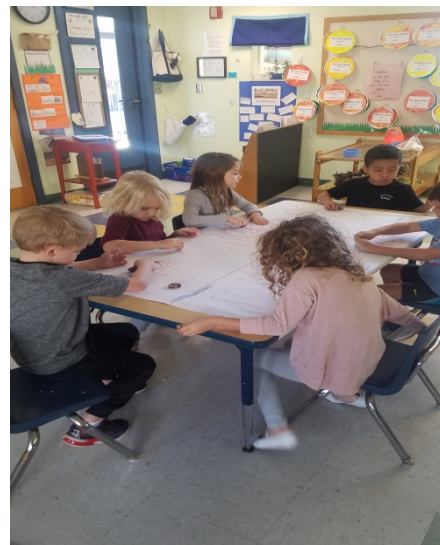
2. Bake 'em and color.