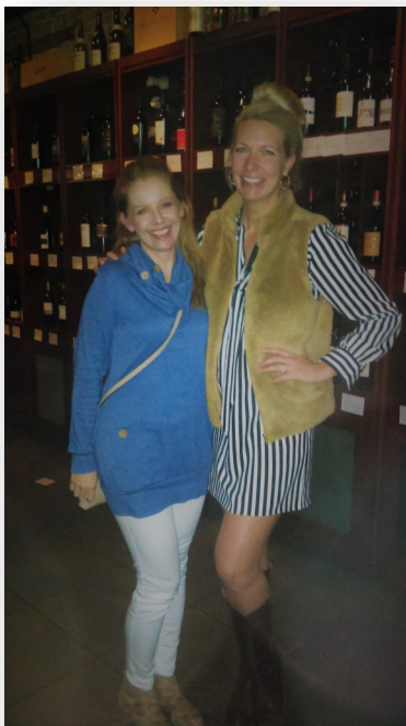
PTO President and Vice President at Mom's Night Out!