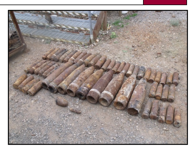
Ordnance Recoveries from Joint Clearance Operation