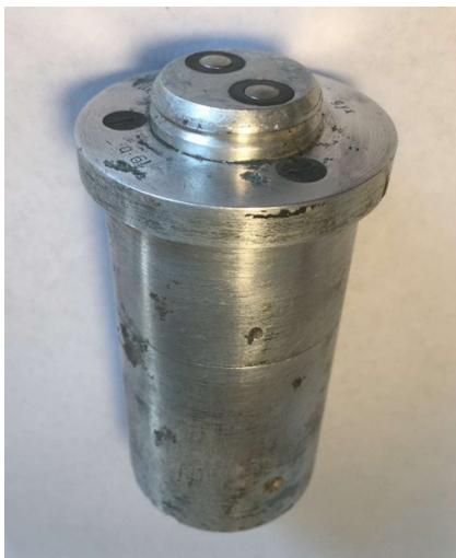
Photo below shows a typical WW2 German fuze

Length: 100mm 4 inches Diameter: 60mm 2.5 inches