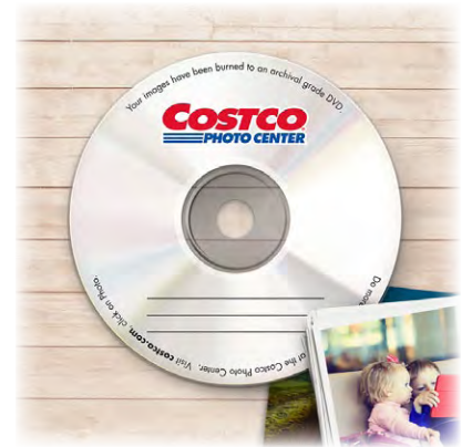
Photo DVDs from GoF West 2017