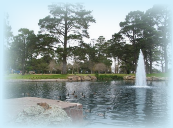
Waller Park Lakeside Terrace, site of the Welcoming Party