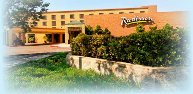
Santa Maria Radisson