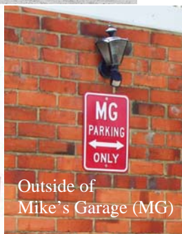
Outside of Mike's Garage (MG)