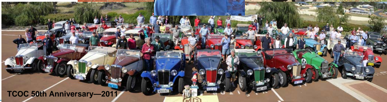
TCOC 50th Anniversary—2011