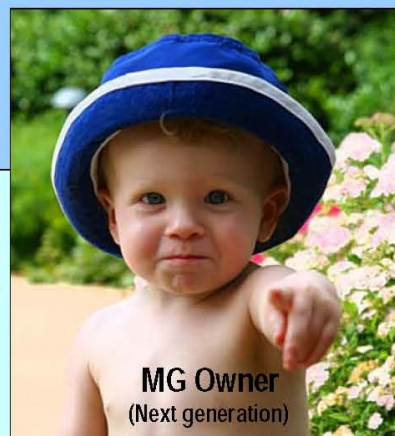
MG Owner (Next generation)