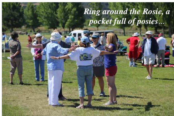
Ring around the Rosie, a pocket full of posies...

Respectfully submitted, Dave Bradley, Secretary