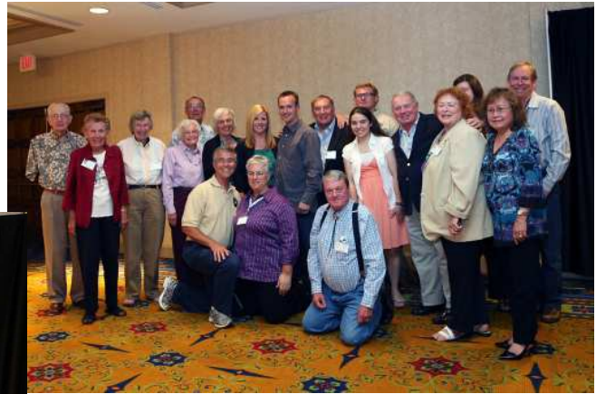
The TC Motoring Guild