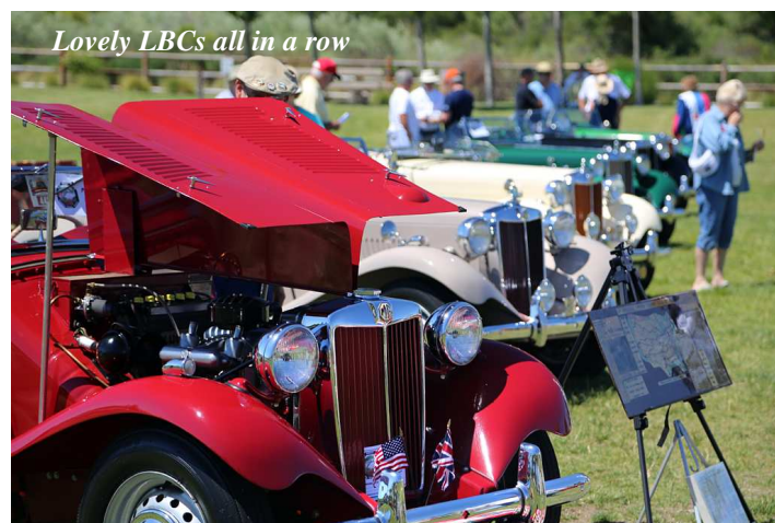
Lovely LBCs all in a row