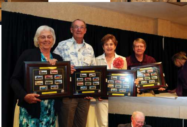
Almost everybody was able to take an award home with them