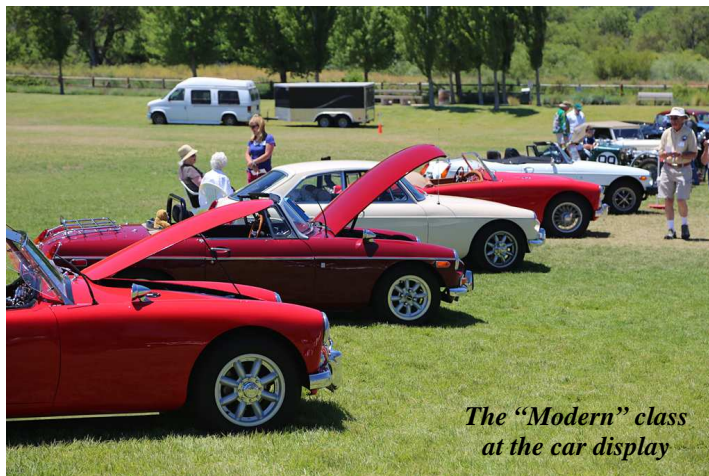
The “Modern” class at the car display

The car display is probably the most popular event at the GoF's, and this years car display was no exception. It is hard to find green grass in the summer time in the Valley, especially for parking a large group of cars for dis-