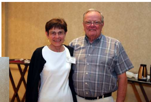
The RMMGTR Group, from Florida