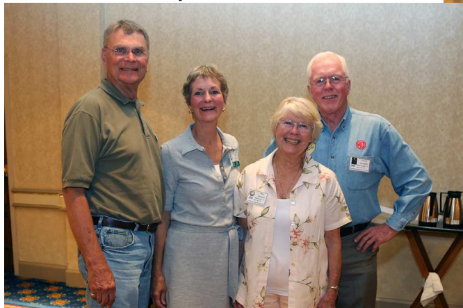
The Sacramento Valley MG Club