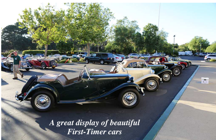
A great display of beautiful First-Timer cars

The park grass area is huge! It is so big that we were able to arrange the cars on 15 foot centers, with 15 feet between the rows and still have lots of area left. Larry, being the engineer that he is, had the Paradise Club helpers arrange the cars so that they were all parked at the same angle, with the parkers using giant protractors to get