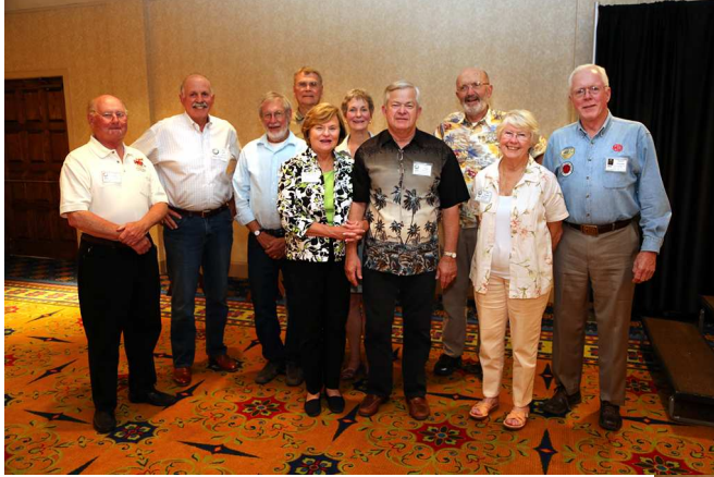
The Sacramento Valley MG Club