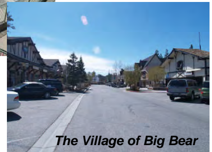
The Village of Big Bear