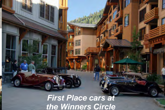
First Place cars at the Winners Circle