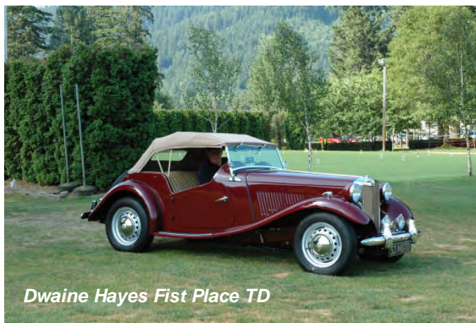
Dwaine Hayes First Place TD