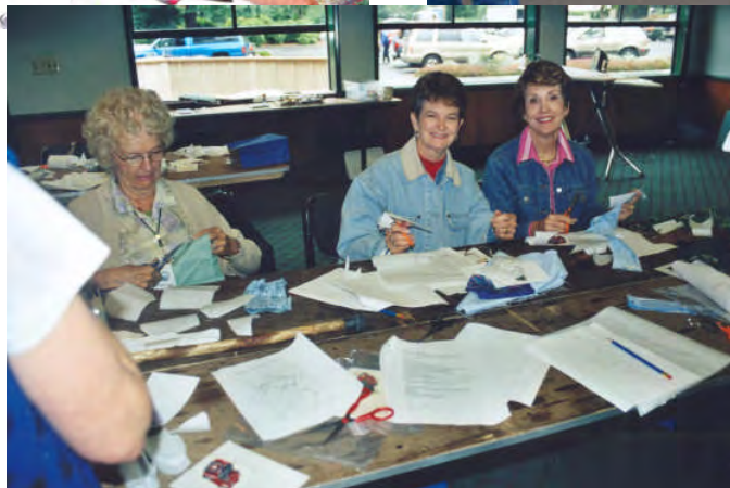
The Fabric Post Card session was a smashing success