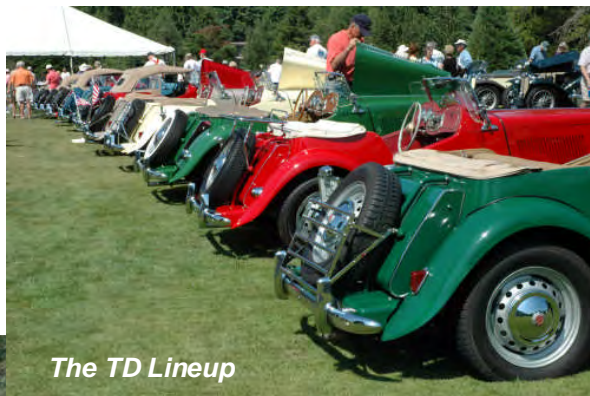
The TD Lineup