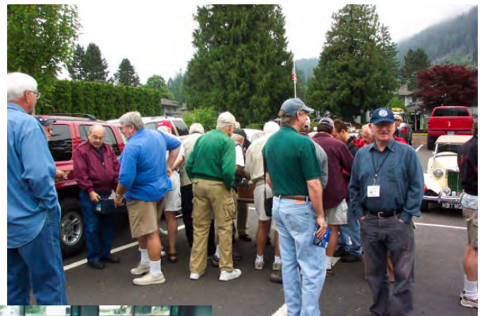
Many good buys were found at the autojumble