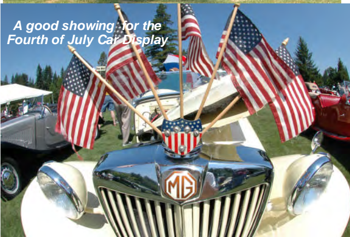
A good showing for the Fourth of July Car Display