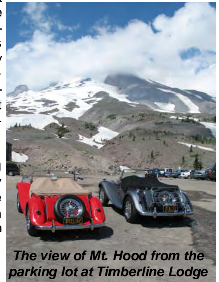
The view of Mt. Hood from the parking lot at Timberline Lodge