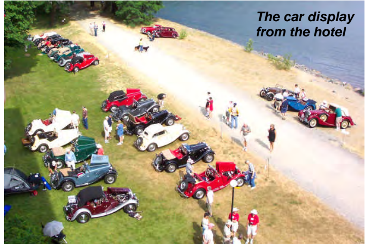
The car display from the hotel