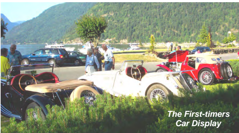
The First-timers Car Display