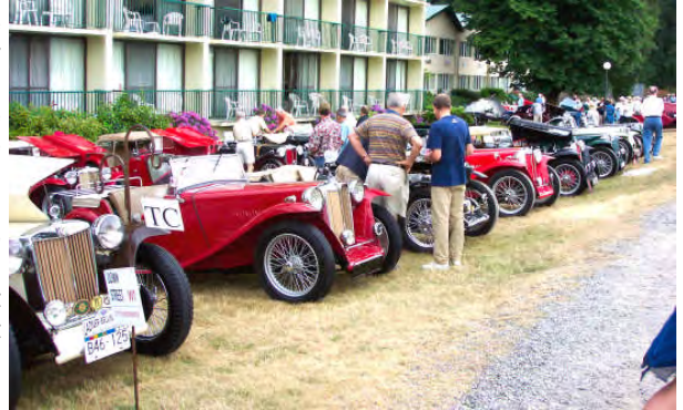
Two views of the car display at the hotel

The 122 registrants, including 15 In-spirit registrants, represented 25 different MG clubs from the West-