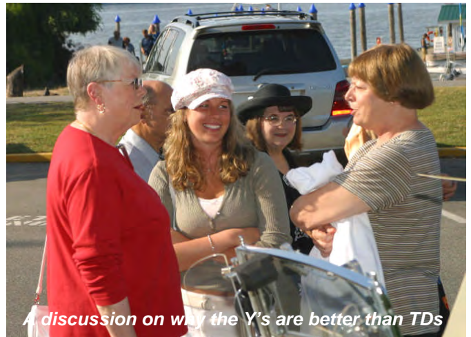
A discussion on why the Y's are better than TDs