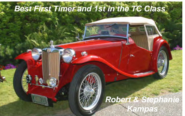
Best First Timer and 1st in the TC Class