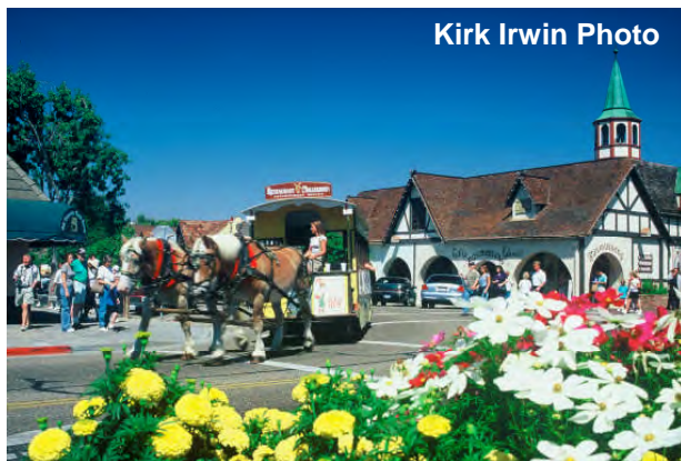
Kirk Irwin Photo

One of the major attractions of the valley is the Pacific Coast Performing Arts Theater in Solvang, just 3 miles from the hotel. The PCPA theater offers first class Broadway productions in an open air theater, and, during this GoF, will be doing "Guys and Dolls", an outstanding, long-running Broadway musical. We have arranged to set aside a block of seats for this event on Wednesday evening, at just $16.00 per seat for seniors. In addition, we have arranged to have a really good chicken dinner at the theater prior to the show for only $10.00 per person. So if you are interested in enjoying the evening in this manner, you should sign up for this event. The number of tickets are limited, and must be arranged for ahead of time. Cut-off date for signing up for this event is the May 30, 2005. (other local eateries)