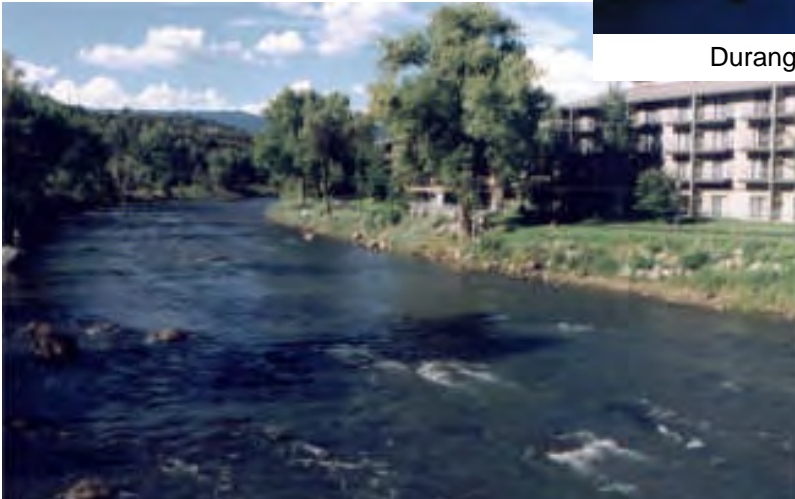
The Doubletree Hotel on the Animas River in Durango

the attendees of the GoF West and the scenery will delight all that view it through the windscreens of their MG's.