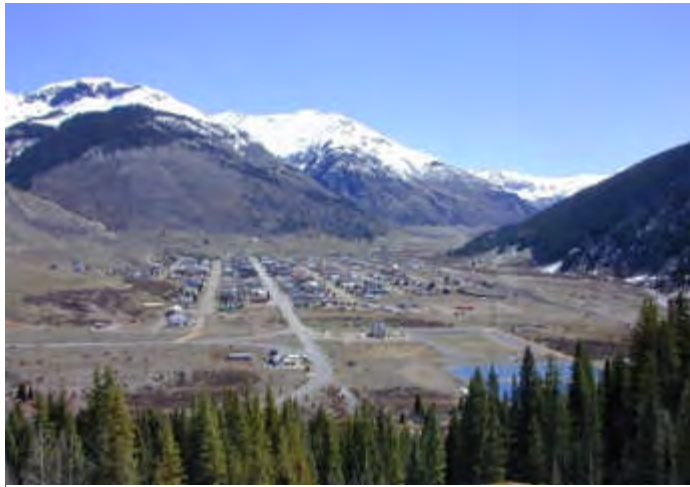
Silverton, Colorado. Get there on the D&SRR

towns in Colorado, with fascinating history to explore and discover Silverton. Surrounded by high mountains on all