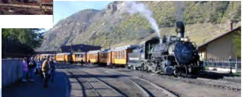
Durango and Silverton Narrow-gauge Railroad

The GoF activities day of the 26 th of June will allow attendees to enjoy the day on the Durango & Silverton Narrow Gauge RR, an adventure not to be missed. The Durango & Silverton RR is one of the premier narrow gauge railways in the U.S., if not in the entire world.