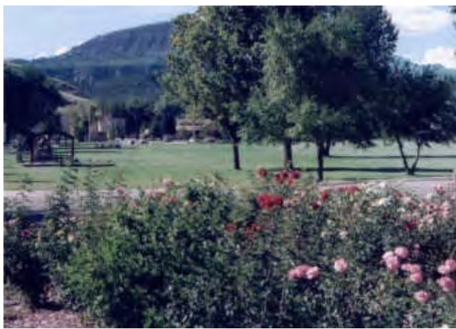
Santa Rita Park, on the Animas River

Though not a part of the planned activities of the GoF due to time constraints, a trip north of Silverton over Red Mountain into Ouray provides some of the finest vistas in the State. One could spend many days visiting the late 1800's mining history of this district and the impact the narrow gauge railroads had