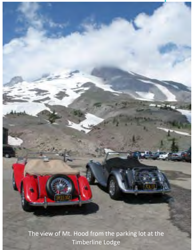
The view of Mt. Hood from the parking lot at the Timberline Lodge