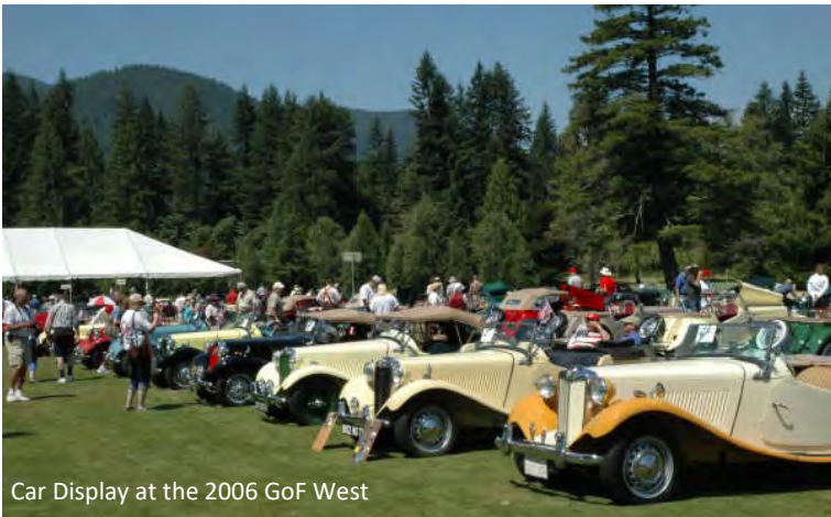
Car Display at the 2006 GoF West