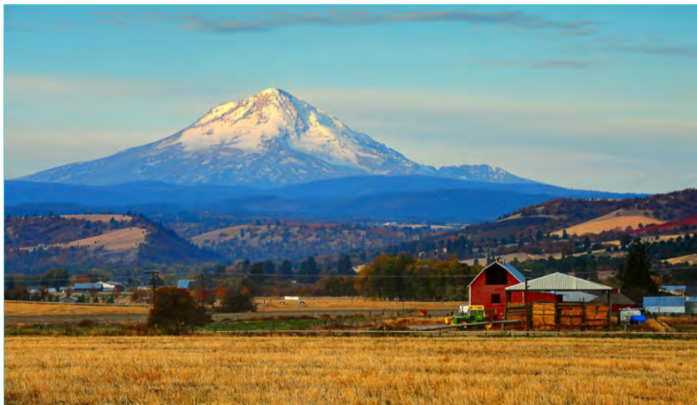
Mt. Hood landscape by Jean Beaufort