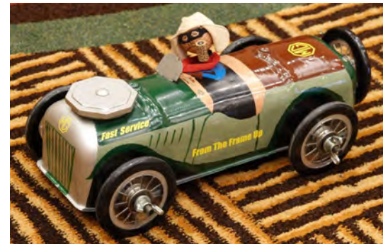
First Place in Valve Cover Display & First Place in Valve Cover Race (Unlimited Class) - Doug Pelton