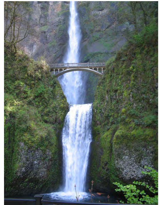
Multnomah Falls is a breathtaking 611 foot tall waterfall located in the Columbia River Gorge.