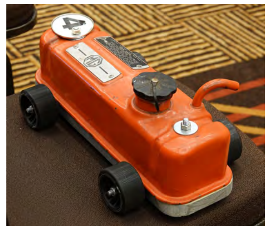
First in Valve Cover Race (Regulation Class) & Second Place in Valve Cover Display - Scot Campbell