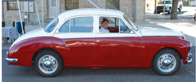
First Place MG Postwar Variant 1959 MG Magnette - Art Kaplan