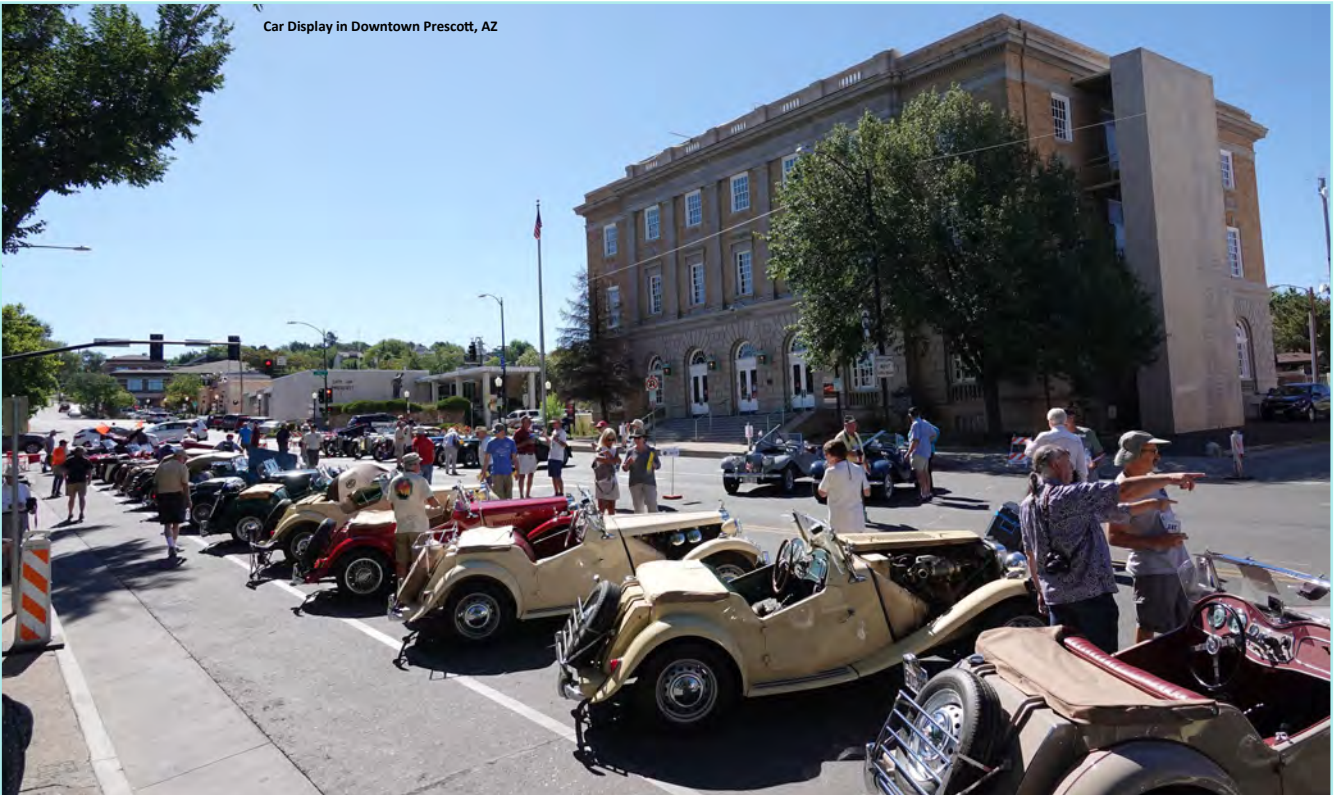
Car Display in Downtown Prescott, AZ