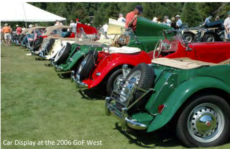
Car Display at the 2006 GoF West