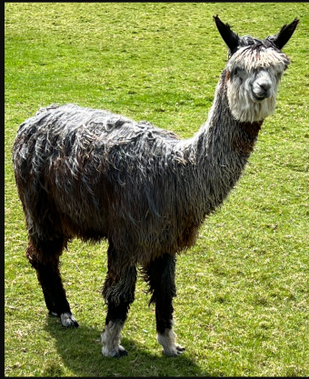
Dark Sky Gray Gordon (m)

2022 National Halter Show 2nd Suri Junior Male Grey 2022 Spring Alpaca Fiesta 2nd Suri Junior Male Grey