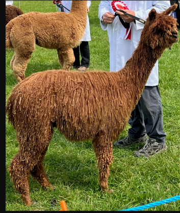
Dark Sky Gersemi (f)

2022 National Halter Show 2nd Suri Junior Male Grey 2022 Spring Alpaca Fiesta 2nd Suri Junior Male Grey