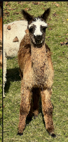
Dark Sky Desdemona (f)