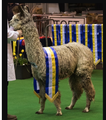
Wellow Va Va Voom