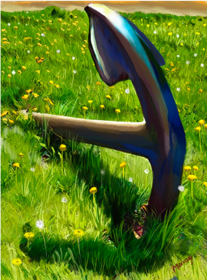
Soper Park Anchor