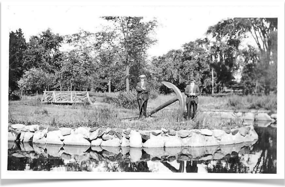
This image, according to the Memories FB site, where it appeared, is from the early 1900s when Soper Park was known as Jackson Park.