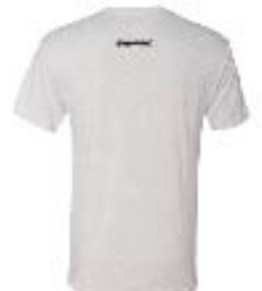
SMALL UPPER BACK: SUB AVG SIZING 3-3.5" W