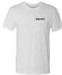
LEFT CHEST: LC AVG SIZING 3-3.5" W