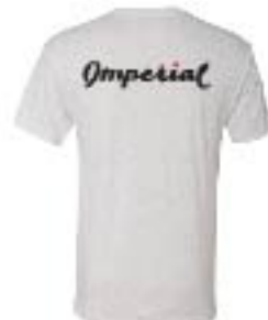
FULL BACK: FB AVG SIZING 12.5" W