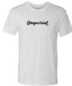
SMALL CENTER CHEST: SCC AVG SIZING 7.5" W