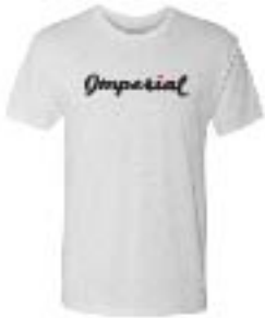
FULL CHEST: FC AVG SIZING 12.5" W