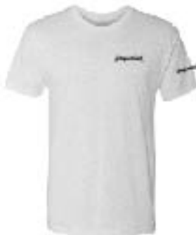
LEFT SLEEVE: 1LS AVG SIZING 1.5 - 2.5" W (1" above cuff)