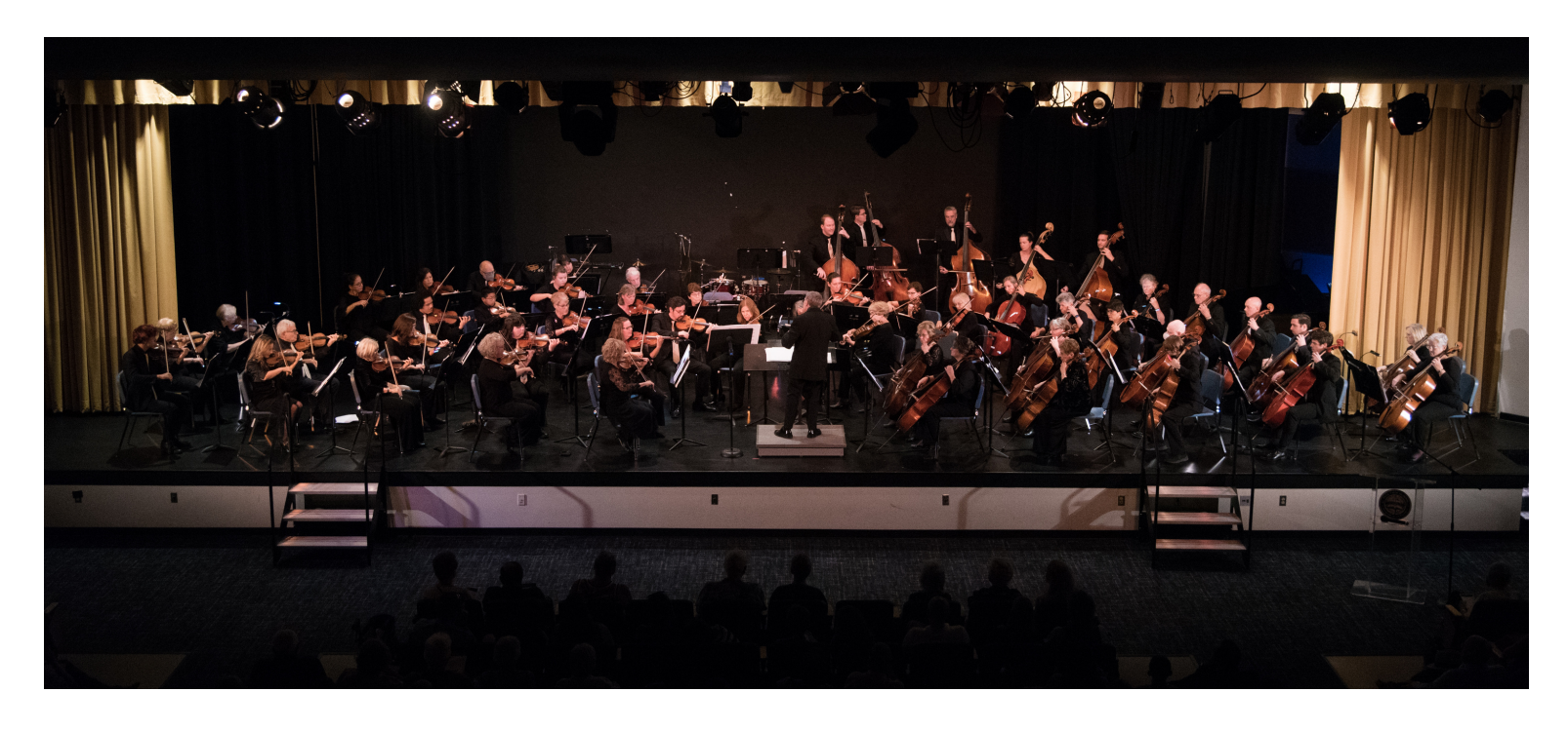
Kenneth Bowermeister Auditorium, Pine View School, Spring 2023

Strings Con Brio was incorporated in 2015, and received 501(c)(3) designation in 2016. The organization began with providing collaborative performances for events in the community, and now performs as a conducted ensemble.