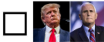
DONALD TRUMP (PRESIDENT) MIKE PENCE (VICE PRESIDENT) (REPUBLICAN)