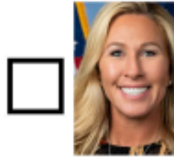
MARJORIE TAYLOR GREENE INCUMBENT (REPUBLICAN)