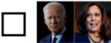
JOE BIDEN (PRESIDENT) KAMALA HARRIS (VICE PRESIDENT) INCUMBENT (DEMOCRAT)