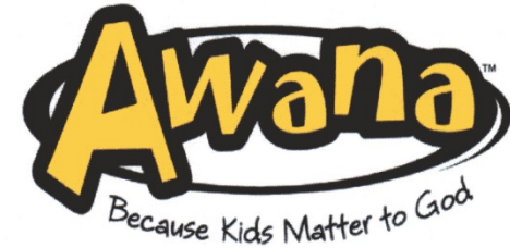
AWANA Club Night Schedule