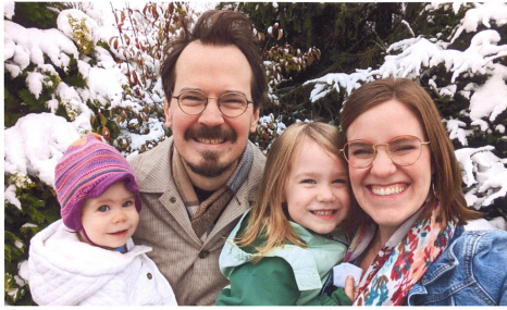
The Jacksons | 2022