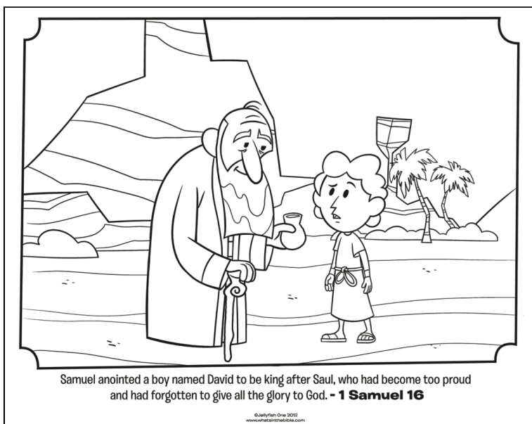
Samuel anointed a boy named David to be king after Saul, who had become too proud and had forgotten to give all the glory to God. - 1 Samuel 16