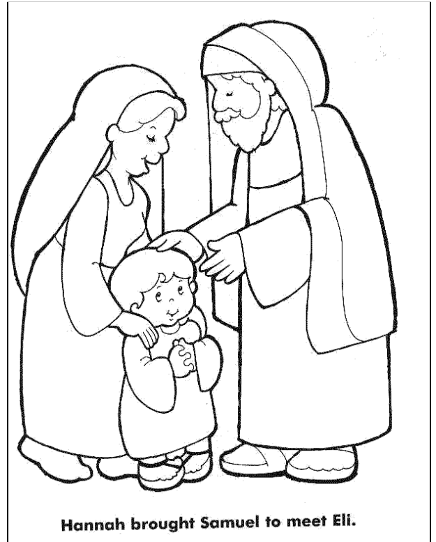
Hannah brought Samuel to meet Eli.