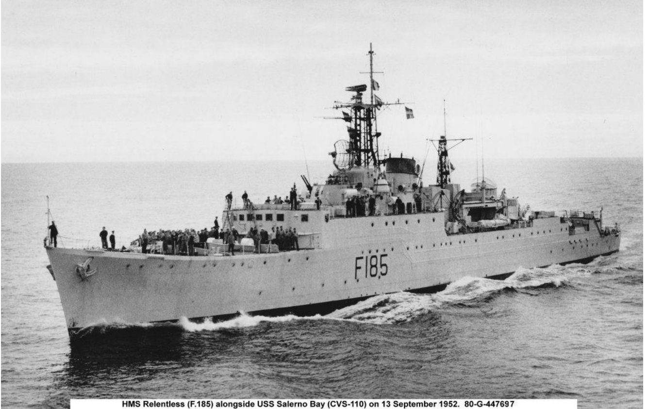
HMS Relentless (F.185) alongside USS Salerno Bay (CVS-110) on 13 September 1952. 80-G-447697