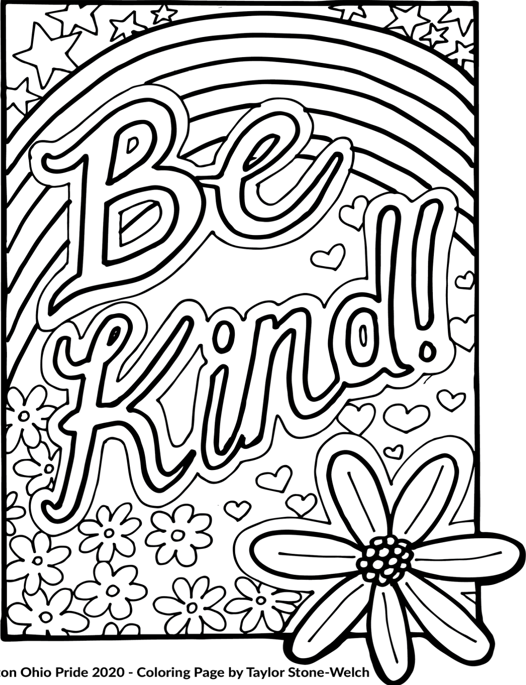
Hamilton Ohio Pride 2020 - Coloring Page by Taylor Stone-Welch