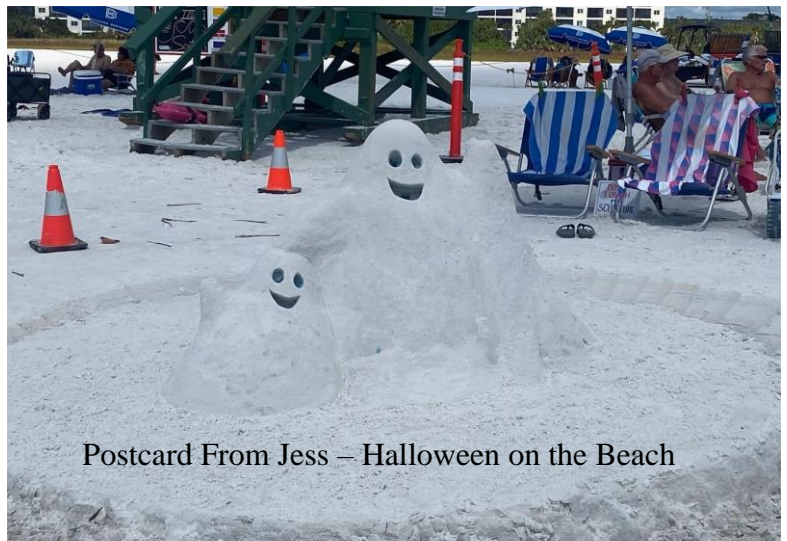
Postcard From Jess – Halloween on the Beach