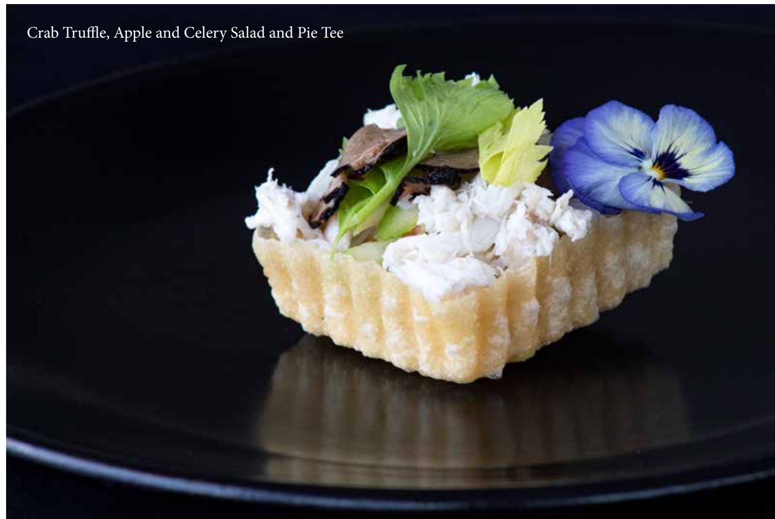
Crab Truffle, Apple and Celery Salad and Pie Tee