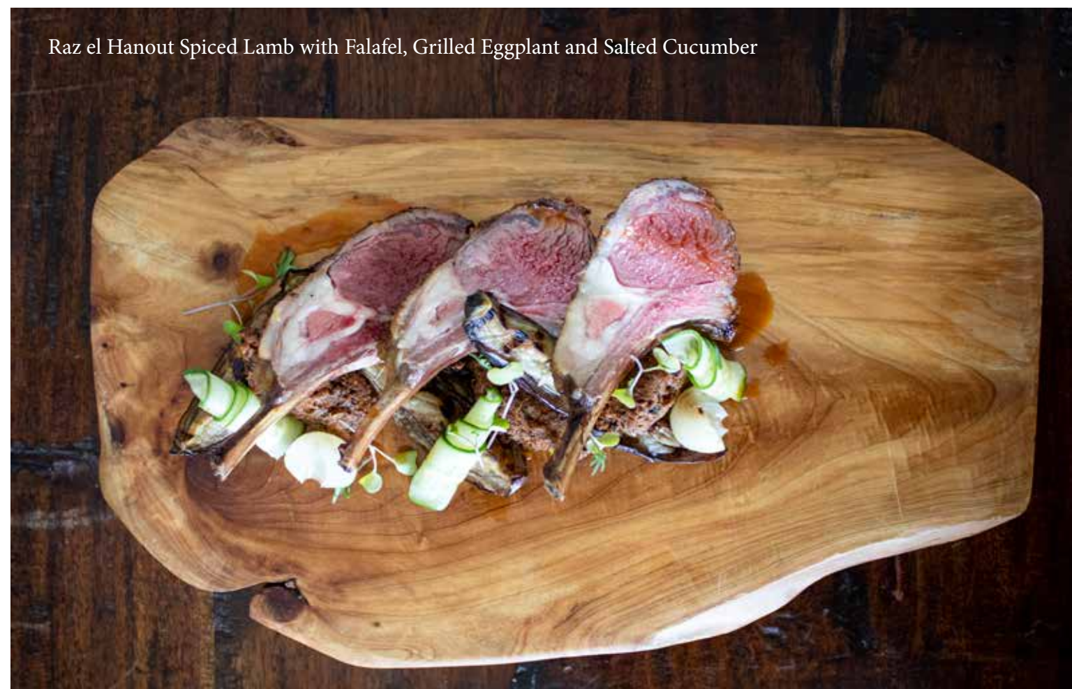
Raz el Hanout Spiced Lamb with Falafel, Grilled Eggplant and Salted Cucumber