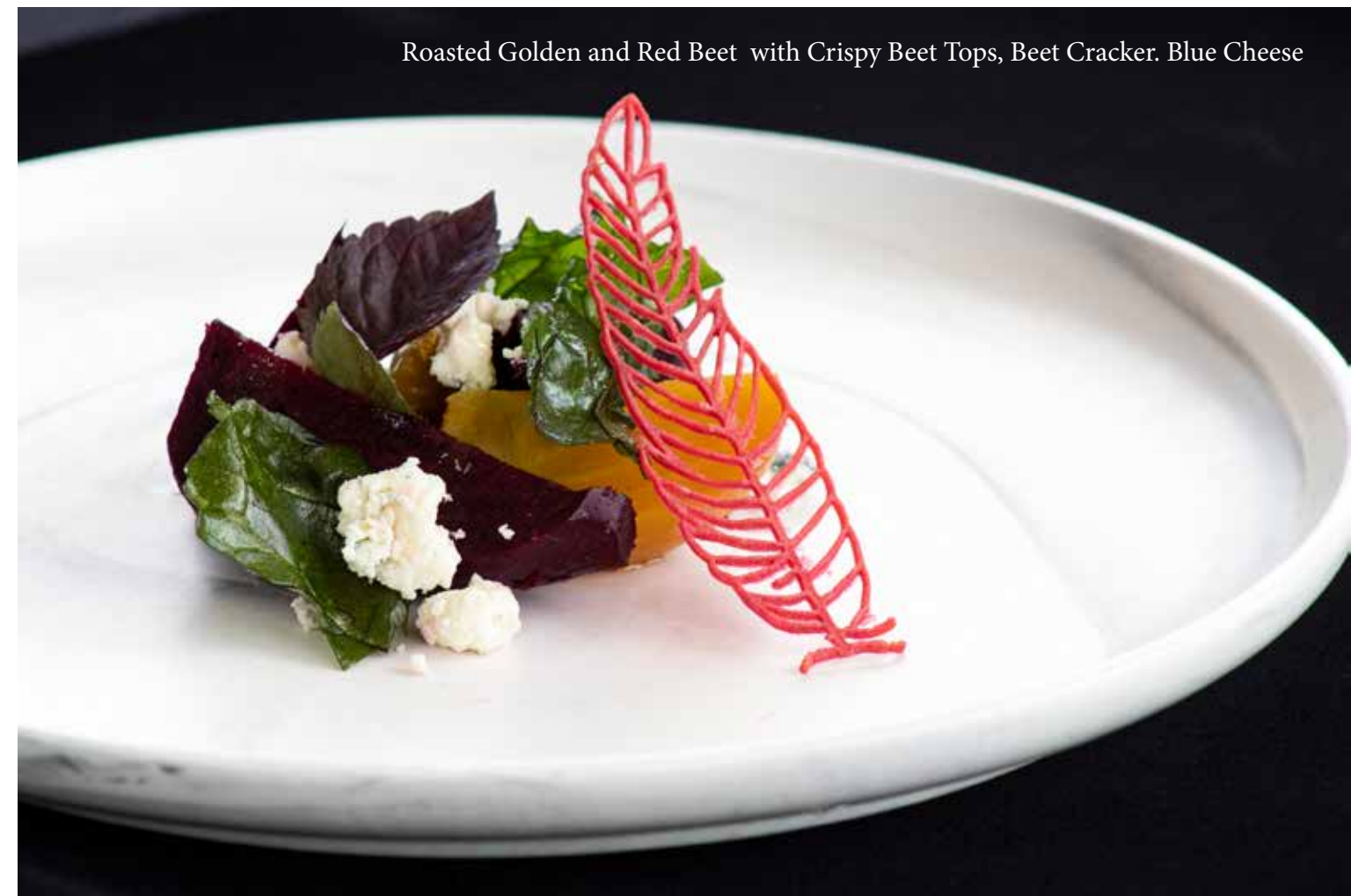
Roasted Golden and Red Beet with Crispy Beet Tops, Beet Cracker. Blue Cheese