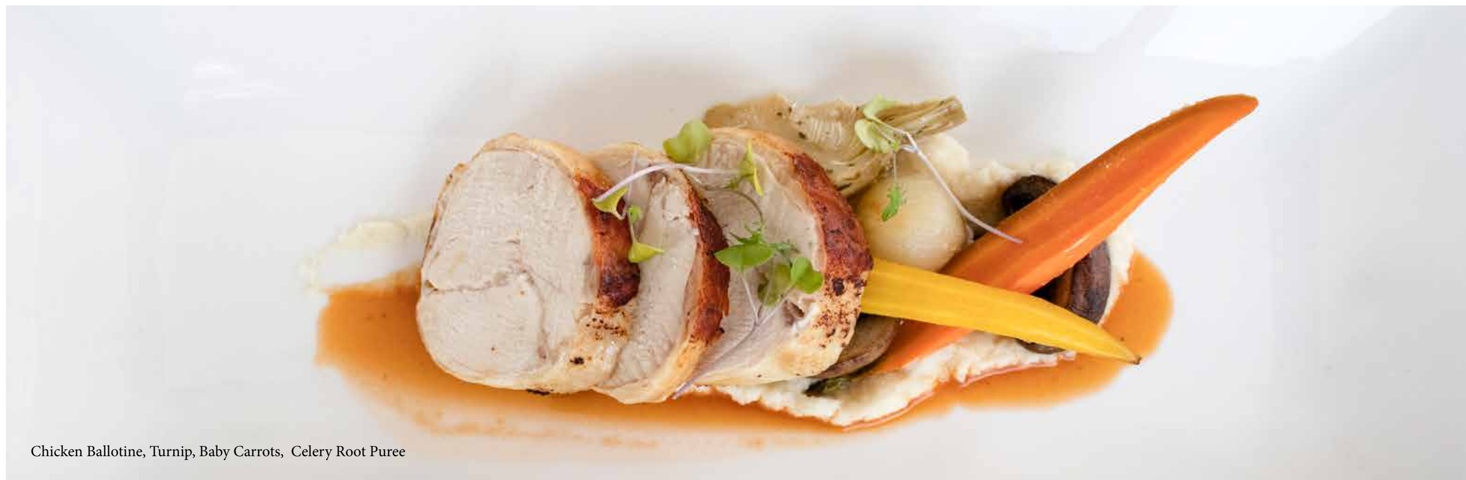
Chicken Ballotine, Turnip, Baby Carrots, Celery Root Puree