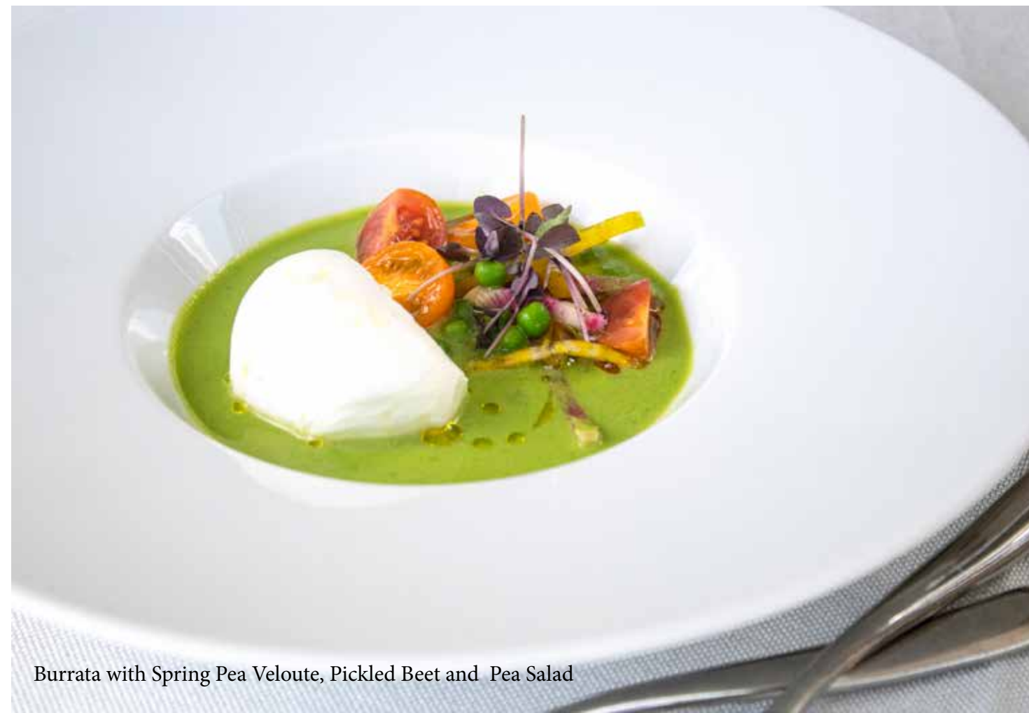
Burrata with Spring Pea Veloute, Pickled Beet and Pea Salad