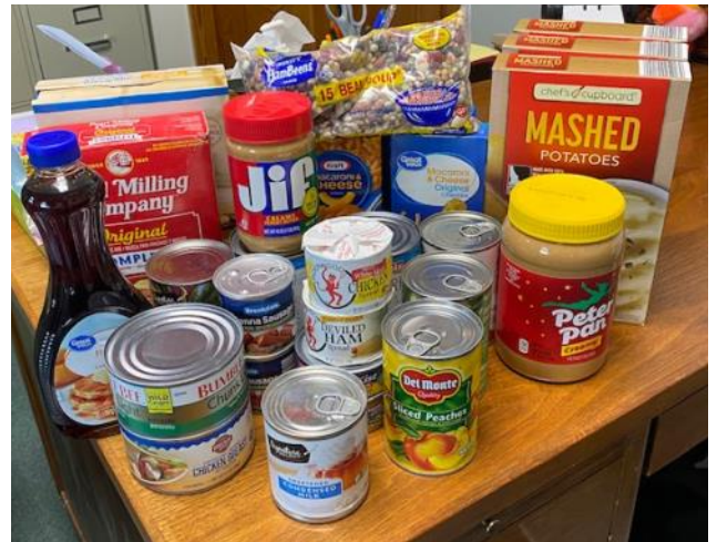
34 items donated in July ~ thank you!!

The Net will take any non-perishable items you wish to donate.