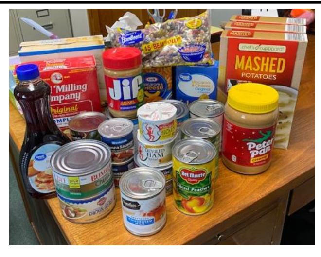
34 items donated in July ~ thank you!!

The Net will take any non-perishable items you wish to donate.