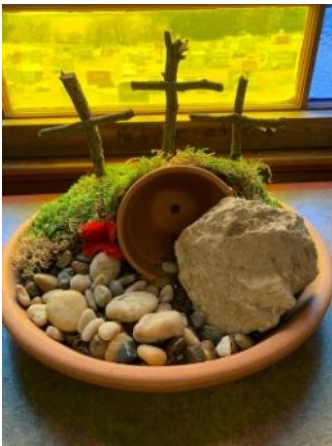
Sunday School Tomb