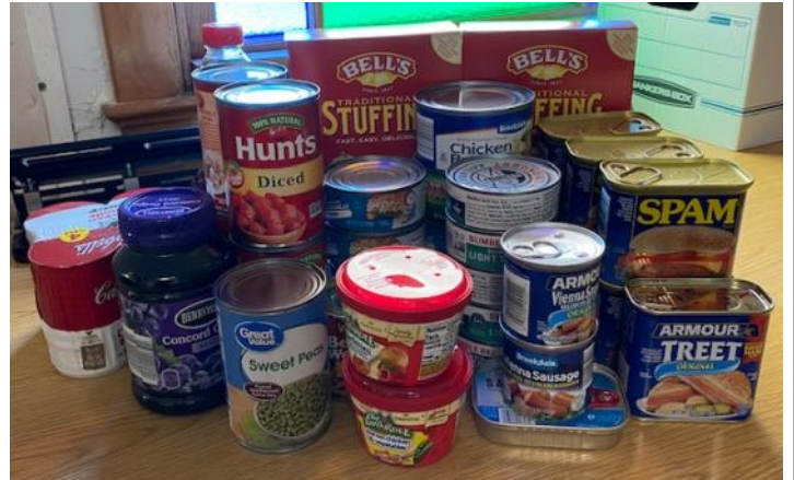
March-39 items donated

You can drop off items to the church office Monday, Wednesday, Thursday from 9:00 AM to 2:30PM