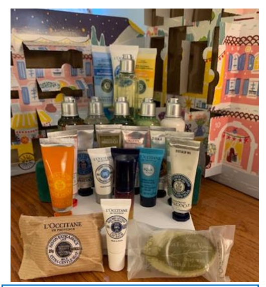
January Gift Calendar, a gift I received for Christmas. It is a way to brighten up January and continue the fun of an Advent Calendar.