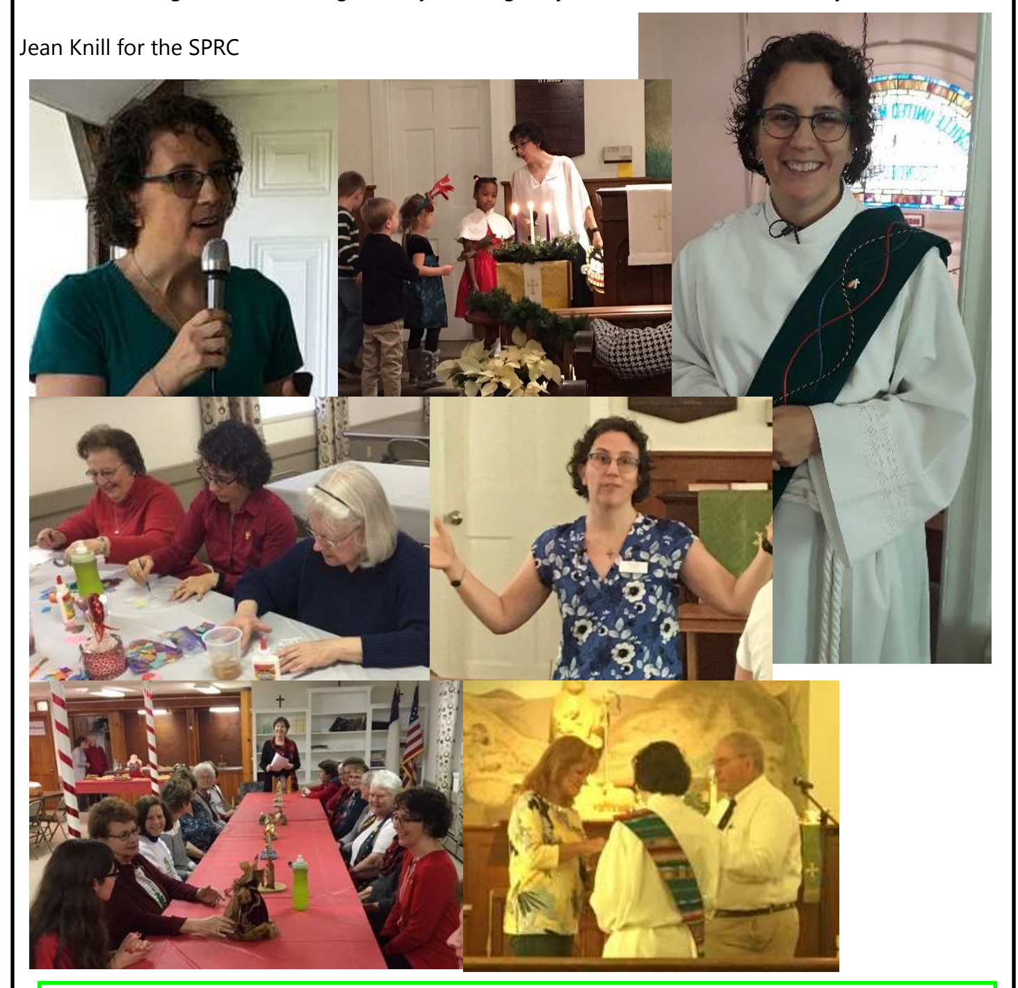
Farewell and Thank You!!

You have been a blessing for TUMC and made the role of the SPRC, being the liaison between the Staff and Congregation, quite easy over the ten months you have served as our interim pastor. You accomplished your personal goals which led you to be able to leave the office and congregation ready for the next pastor. Thank you for leading us through the pandemic with virtual worship and teleconferencing Council meetings. Many blessings in your new role as a missionary.