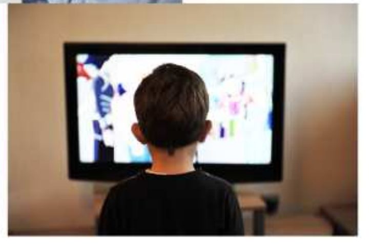
Watch our livestream Taylorsvilleumc.freeonlinechurch.com/live