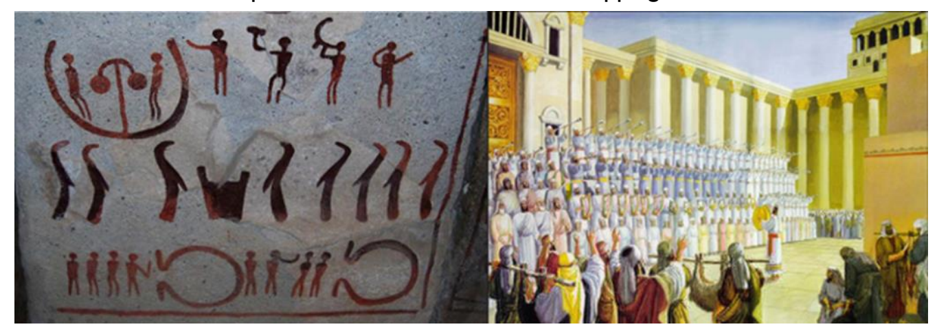
The figure on the left represents an ancient band and the image on the right is depiction of the Davidic Choir in the Temple

We have begun the recruitment for a Worship Music Director, to continue the growth of the music program. Look for the want ad in this newsletter and if you know of a good candidate, please point them to our website to apply. Why is music so important to human cultures and most especially in worshipping of the Lord? I found a wonderful article that answers the question. Regardless of whether or not the music is used in pop culture or in worship: I. It makes it easy to celebrate. 2. Music is a form of expression. 3. It allows us to dance. 4. It continues to evolve. 5. It's an art form. 6. Music is intimate and 7. It's a form of Communication. Reviewing these seven reasons, explaining why music is important culturally, makes it easy to equate the same reasons to the worship of God. We all felt the pain of not being able to sing in church during COVID and now we know why. Interesting Facts: The oldest musical instrument in the world is a Neanderthal flute-60,000 years old. However, the first musical instrument was the human voice. The first percussion instrument was the clapping of hands.