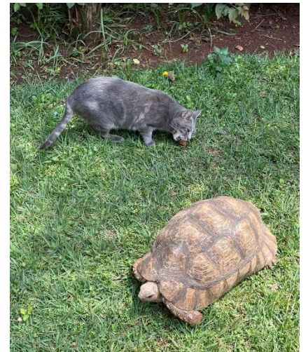
Just a cat and a turtle enjoying lunch in a garden.