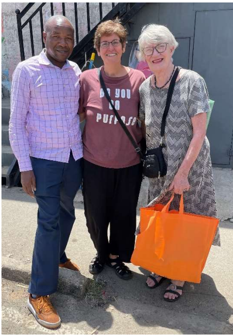
Catching up with friends!