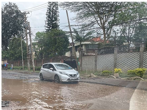
Expansive building and poor drainage can wreak havoc when it rains!