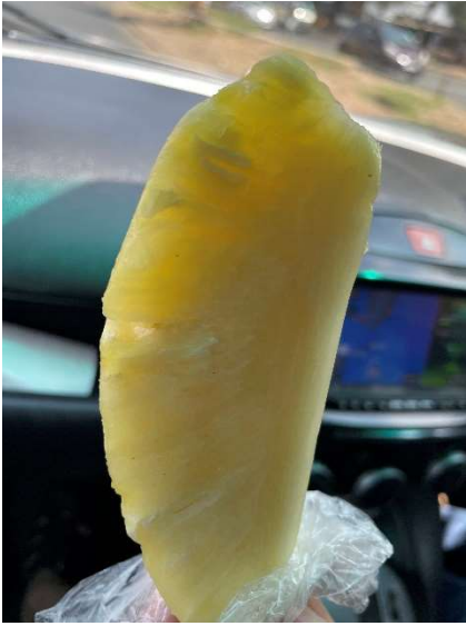
Nothing beats a sweet pineapple spear on a hot day!

Here are a few pictures from Karen's recent visit. Enjoy!