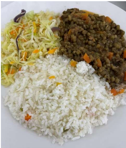
A common meal of cooked cabbage, rice and lentils.