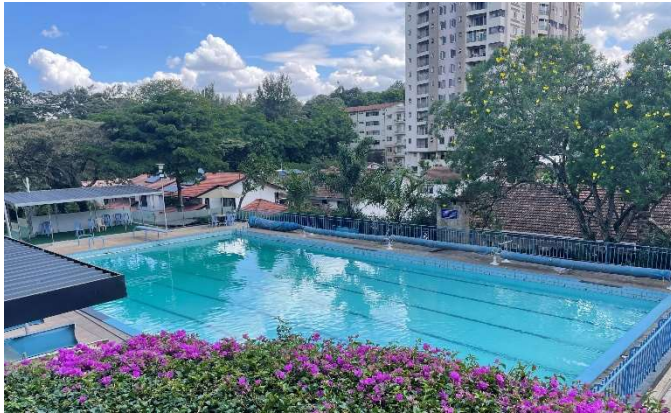
On a hot day under the equatorial sun, the pool is so refreshing!