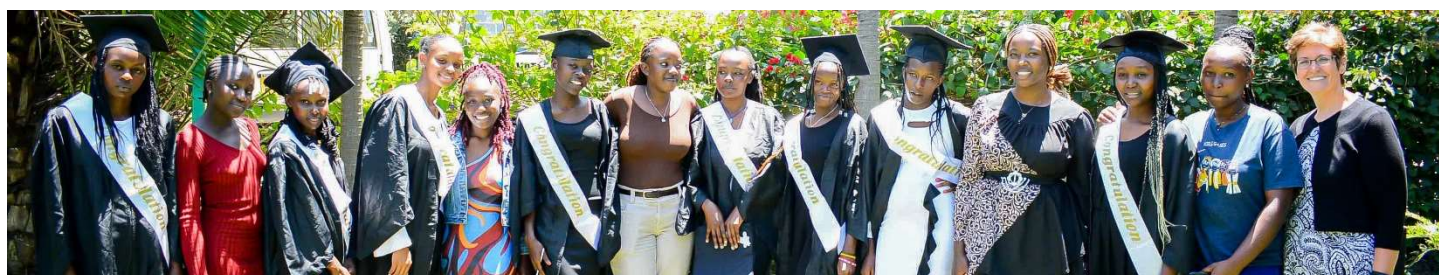
Graduates from both our Amka 2 and Amka 3 Cohorts - growing through your support!