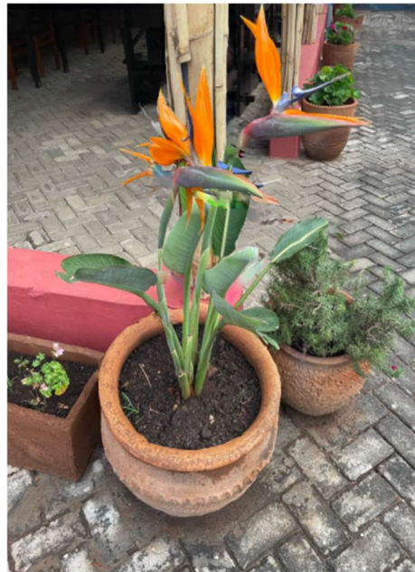
These Birds of Paradise almost looked like real birds!