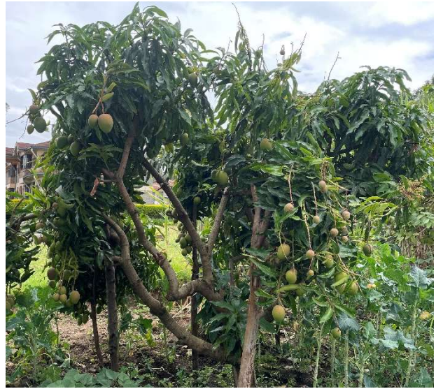
Mango Tree - they aren't ripe yet, but there will be a bounty when they are!