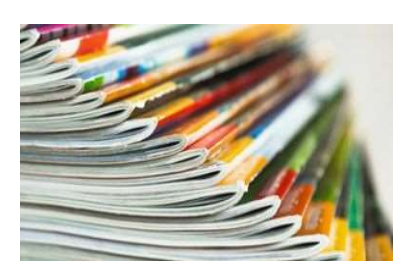
Partnered with Chicago-area students, who collectively clipped over 1,000 magazines!