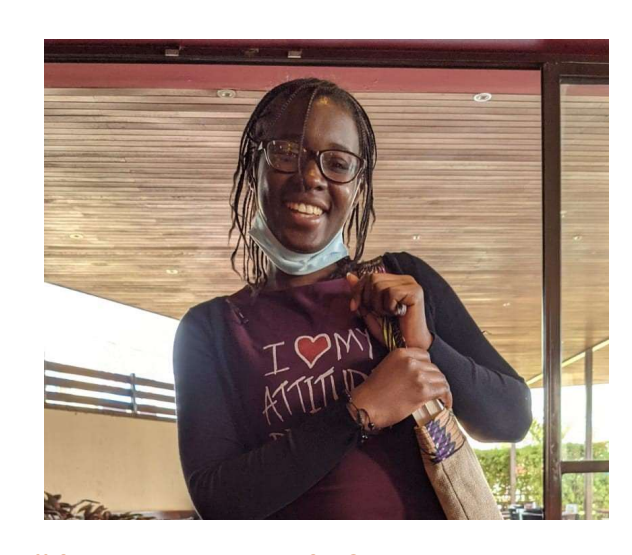
"I'm so happy, it's feels easy seeing now I wish I knew earlier!"