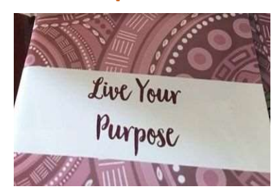
Reached 500 girls through Pads with a Purpose.