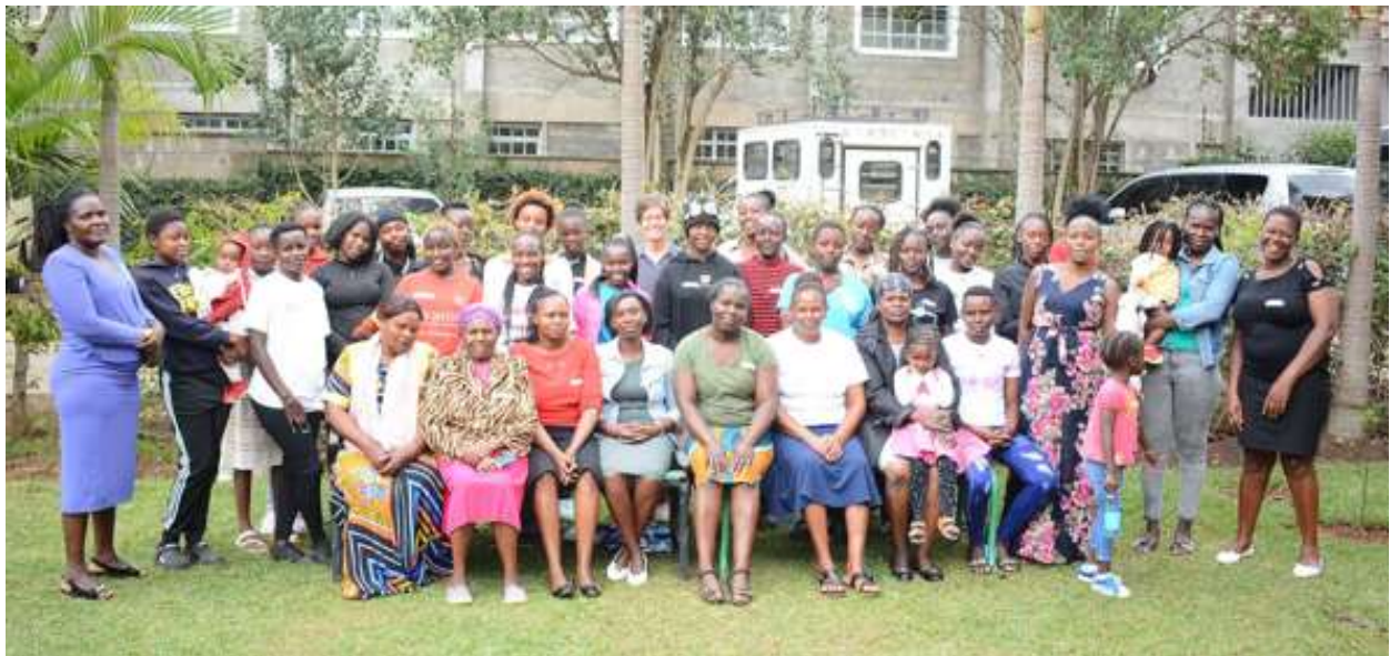
Our Growing Amka Community – pictured includes young women from across our four cohorts and their Moms.