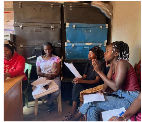
Topic Discussions are a core element of the Amka Program