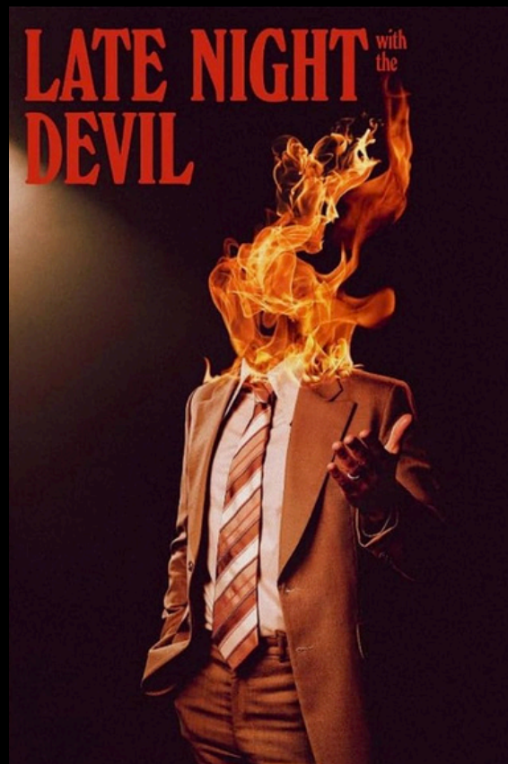
Late Night with the Devil (2023)