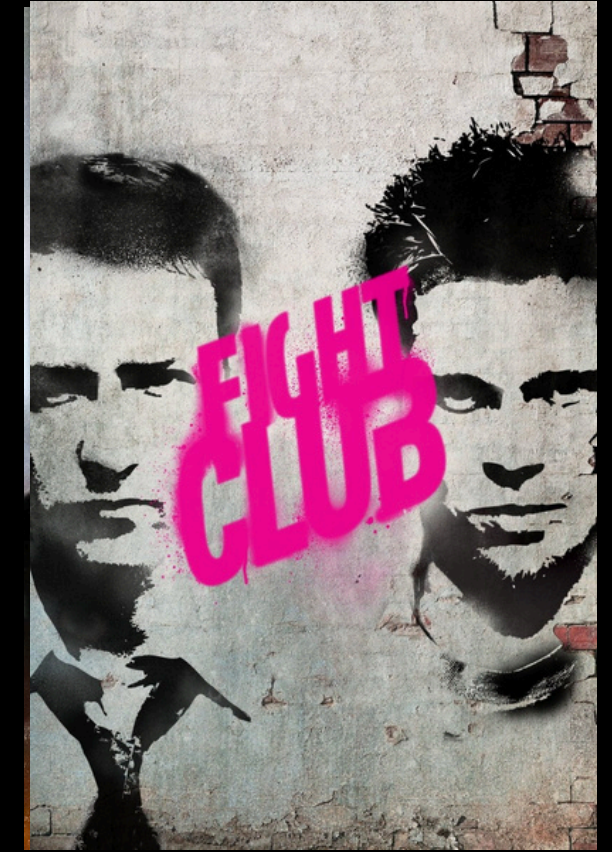
Fight Club (1999)