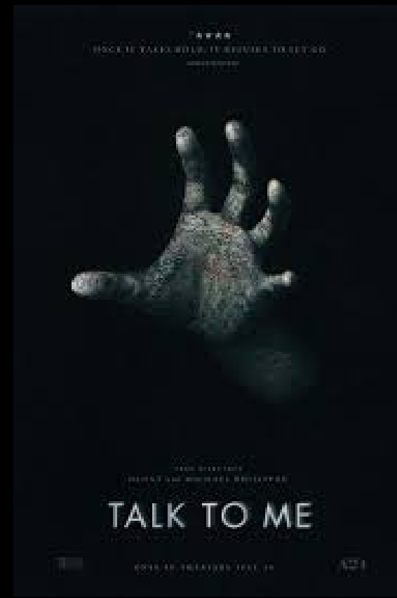
Talk To Me (2022)