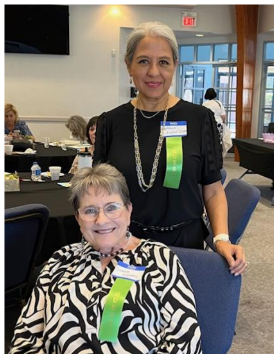
March meeting guests.