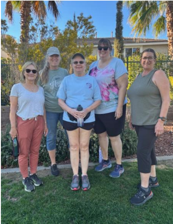
Walking at Goett Park